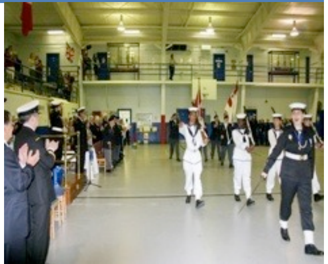
The guard at the VANGUARD review